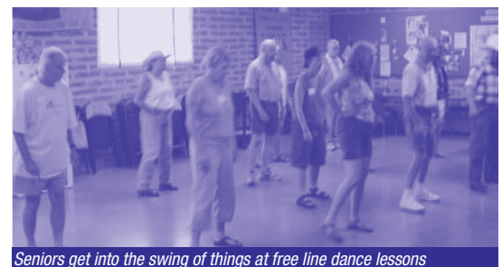
Seniors get into the swing of things at free line dance lessons