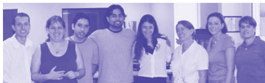
Staff and volunteers at the new center have more usable space

In order to better serve the community and accommodate grassroots LGBT groups, Wingspan has expanded its hours. It is now open to the public 11 am-9 pm on weekdays and 10 am-4:30 pm on weekends. The first floor of the new building is entirely wheelchair accessible, and parking for people with disabilities is located at the front of the building. The back of the building has a full parking lot for other center visitors.