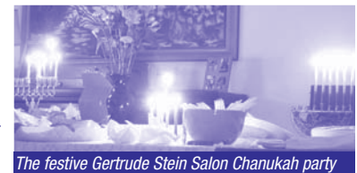
The festive Gertrude Stein Salon Chanukah party