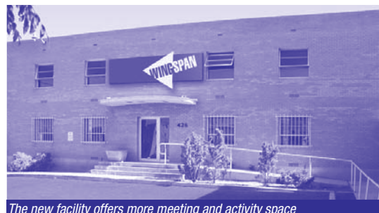
The new facility offers more meeting and activity space

On July 11, Wingspan opened the doors of its new building at 425 E. Seventh Street. The building is just off of Fourth Avenue, one block east of Antigone Books. It is Wingspan's fourth home in its 17 years of service to the community.