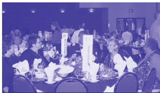
Last year's awards dinner drew a record crowd of Wingspan supporters