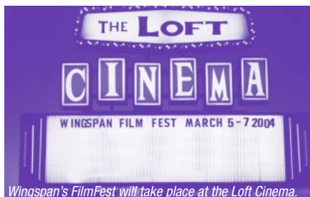
Wingspan's FilmFest will take place at the Loft Cinema.